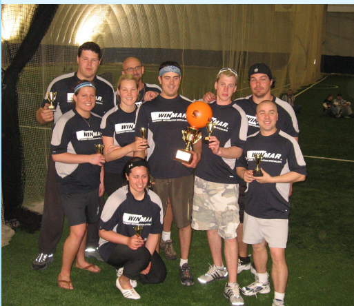
2008 1st Place Team—WINMAR